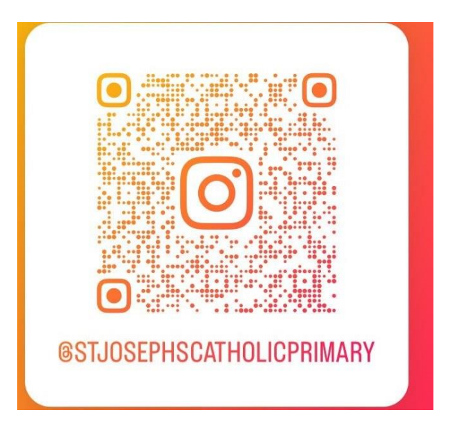
3 - Instagram @STJOSEPHSCATHOLICPRIMARY