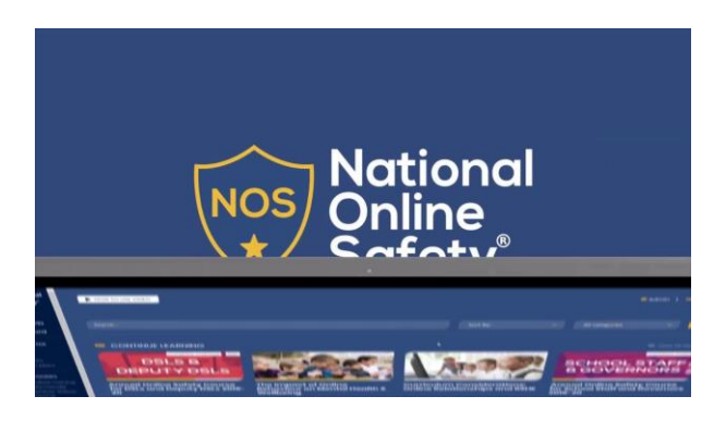
5 - National Online Safety

Please do sign up to this fantastic resource which we also use regularly in school. All schools within Emmaus have been provided with this opportunity to support online safety of our children. I have resent the sign up letter to all parents today.