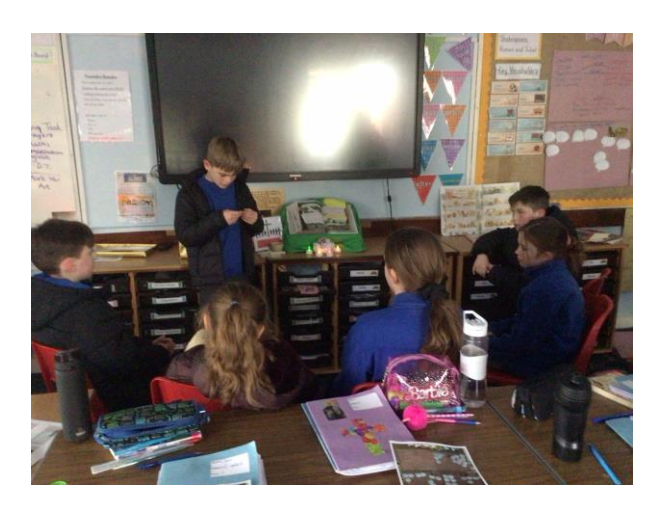
1 - Our Caritas ambassadors reading prayers from the prayer stop in school. During the Year of Prayer we are all encouraged to spend time alone with God.